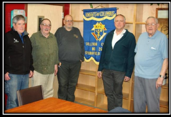
Council 2628 Springfield - Visited 13 March 2019