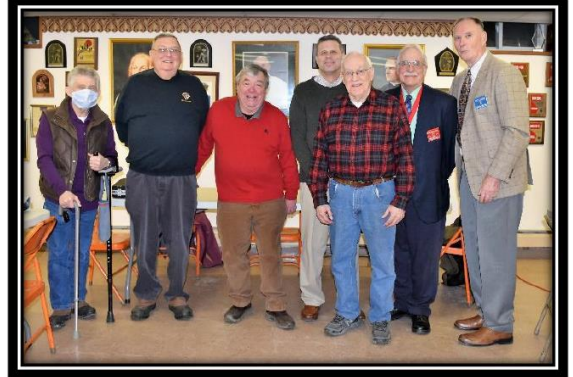
Council 10241 Bethel - Visited 18 March 2019

The message is the same: RECRUIT, RECRUIT, and RECRUIT!