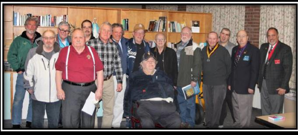
Council 279 Burlington – Visited 5 March 2019