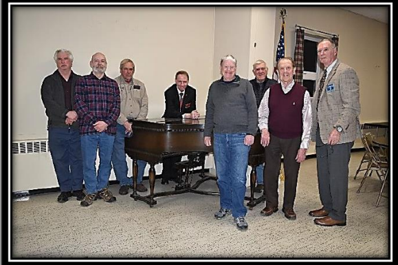
Council 6816 Manchester – Visited 7 March 2019